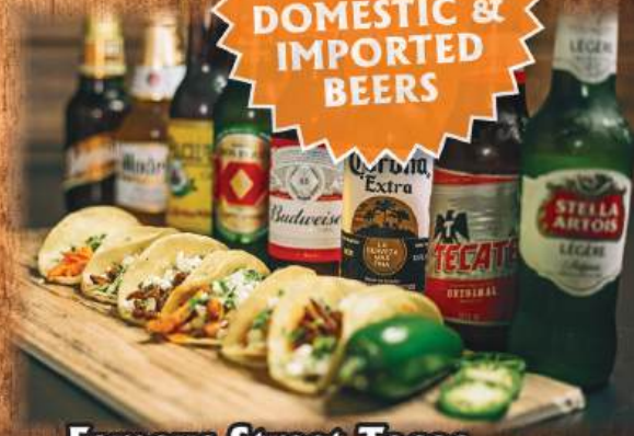
Famous Street Tacos