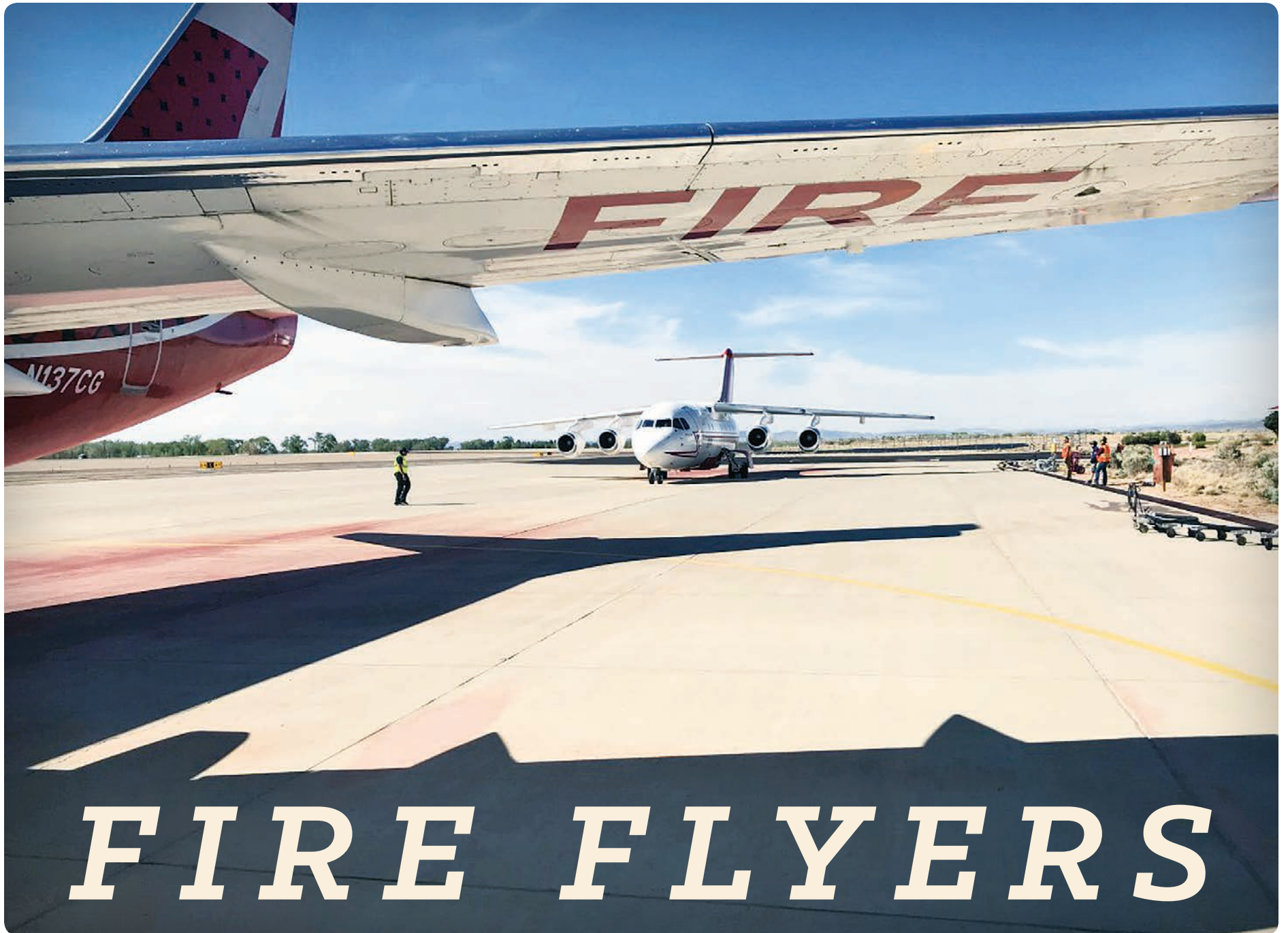
CEDAR CITY AIRPORT