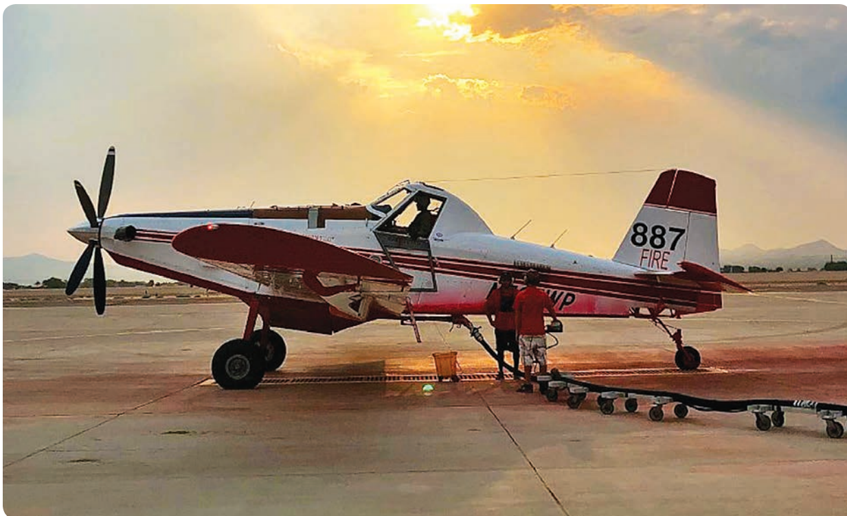
CEDAR CITY AIRPORT

When speaking with the pilots and smokejumpers, it was unanimous that Cedar City is at the top of everyone’s bidding list during fire season because of the location, beauty, and small-town feel.