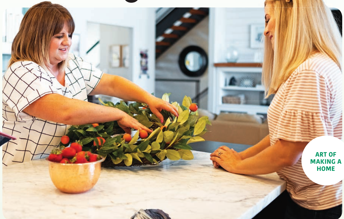
ART OF MAKING A HOME