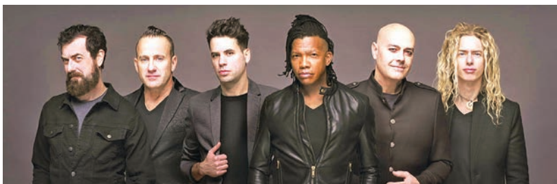
NEWSBOYS UNITED TOUR

Next week we will consider the implications of the Big Bang and what scientists today say about it. I hope that today’s Questions 101.3 has left you with much to think about and that you will return next week for more brain stimulation and mental growth.