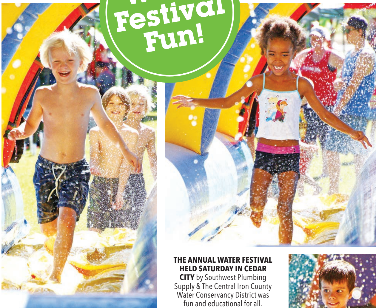
THE ANNUAL WATER FESTIVAL HELD SATURDAY IN CEDAR CITY by Southwest Plumbing Supply & The Central Iron County Water Conservancy District was fun and educational for all.