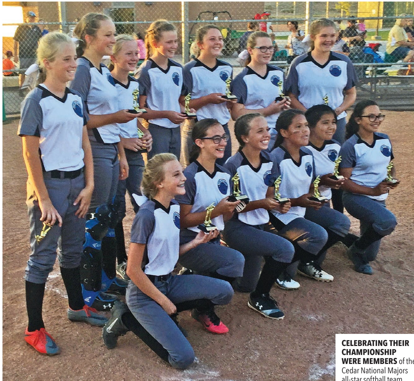
CELEBRATING THEIR CHAMPIONSHIP WERE MEMBERS of the Cedar National Majors all-star softball team.